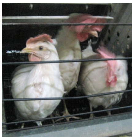
Hens with anaemia due to red mite infestation (note the pale comb).

Each parasite consumes 0.2µl of blood in each bite. As a consequence, anaemia can appear in hens that have a massive infestation of red mites, leading to depressed per-